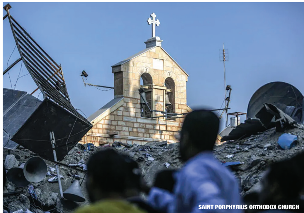
SAINT PORPHYRIOS ORTHODOX CHURCH

Attacked by airstrikes, which led to the destruction of the mosque's minaret and severe damage to its interior.