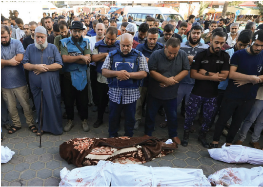
Palestinian journalist Wael Dahdouh praying the janazah (funeral) prayer over his family members, who were targeted and killed in an Israeli airstrike on October 26, 2023.