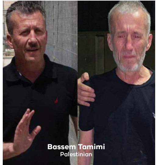
Bassem Tamimi Palestinian