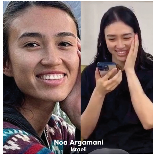
Noa Argamani Israeli